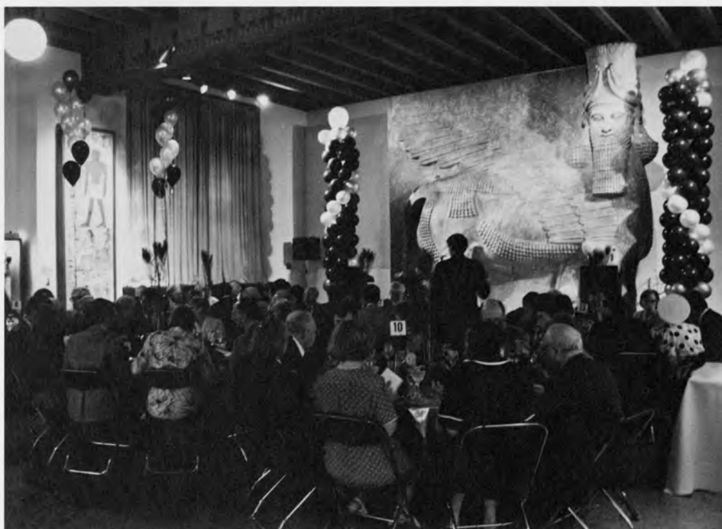
General view of the festivities.